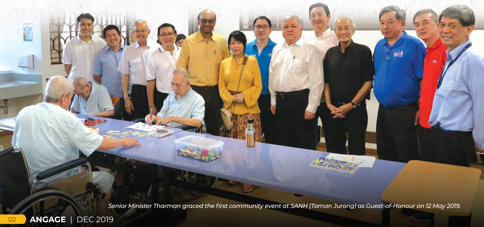
Senior Minister Tharman graced the first community event at SANH (Taman Jurong) as Guest-of-Honour on 12 May 2019.