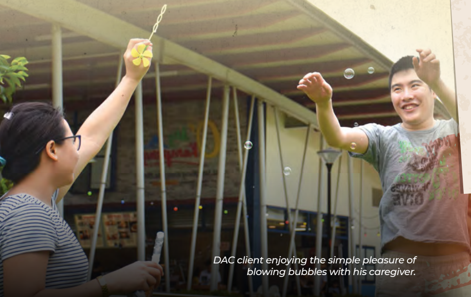
DAC client enjoying the simple pleasure of blowing bubbles with his caregiver.