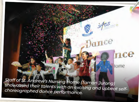
Staff of St. Andrew's Nursing Home (Taman Jurong) showcased their talents with an exciting and upbeat self-choreographed dance performance.

DPM Heng also shared in our joy of being recently appointed by the Ministry of Health as the integrated operator of three eldercare facilities - a nursing home in Tampines North and two Active Ageing Hubs in Bedok North and Bedok South, enabling us to build a new continuum of care in the east.