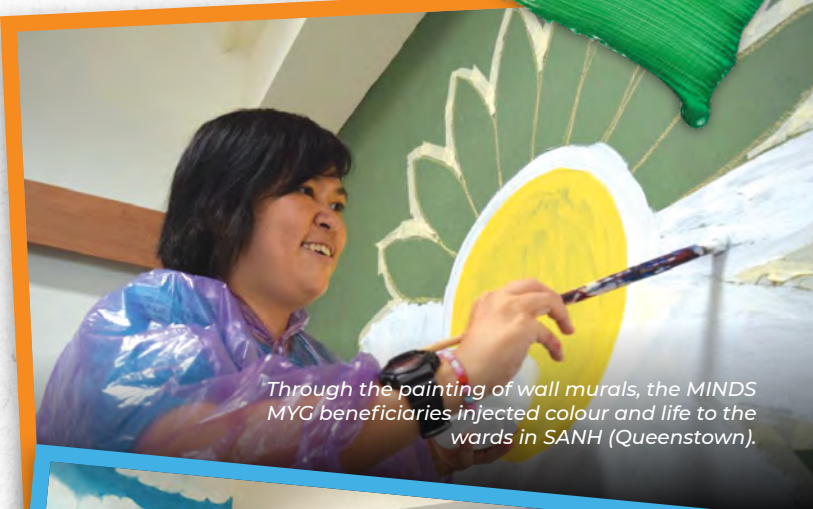
Through the painting of wall murals, the MINDS MYG beneficiaries injected colour and life to the wards in SANH (Queenstown).