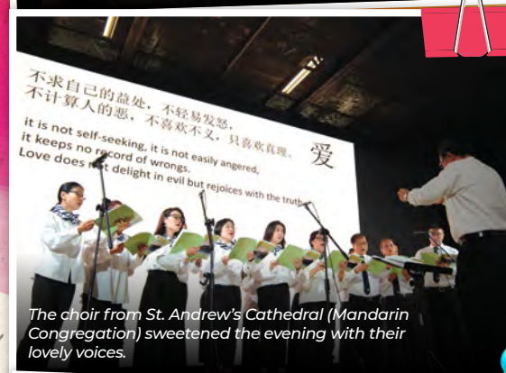
The choir from St. Andrew's Cathedral (Mandarin Congregation) sweetened the evening with their lovely voices.