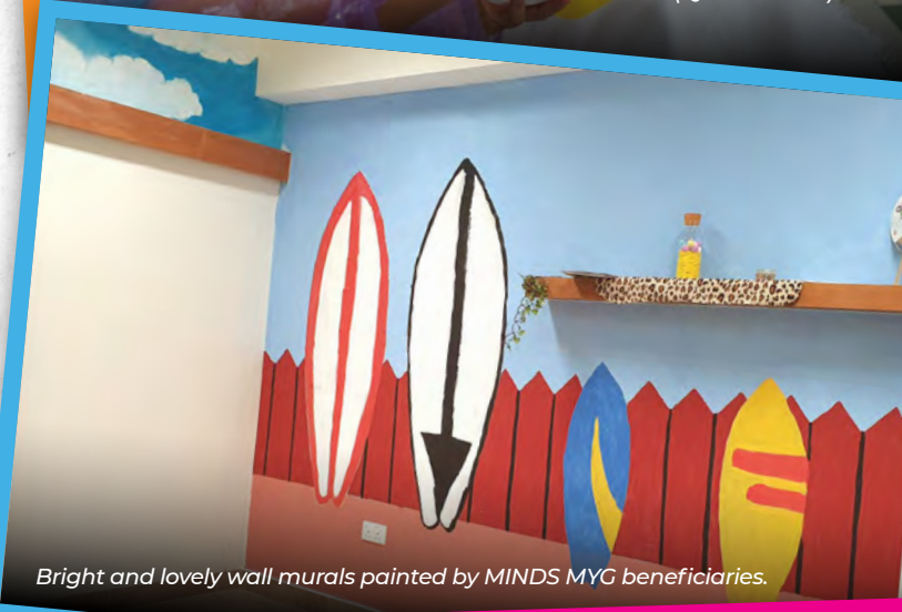
Bright and lovely wall murals painted by MINDS MYG beneficiaries.