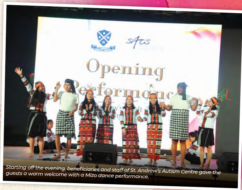
Starting off the evening, beneficiaries and staff of St. Andrew's Autism Centre gave the guests a warm welcome with a Mizo dance performance.