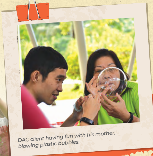
DAC client having fun with his mother, blowing plastic bubbles.