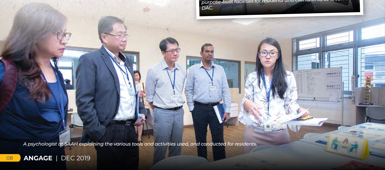
A psychologist at SAAH explaining the various tools and activities used, and conducted for residents.