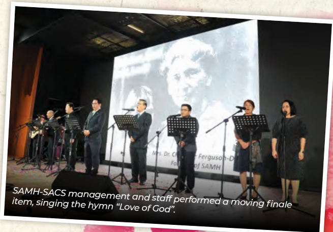
SAMH-SACS management and staff performed a moving finale item, singing the hymn "Love of God".

The evening concluded with the SAMH-SACS anthem, "Here I am, Lord". The lyrics of the chorus, "I will go Lord if You lead me; I will hold Your people in my heart", echoes the hearts of our founders as they responded to God's calling to serve in His unfailing love. This led to the birth of SAMH and SACS, which have served the needs of the community throughout the long history of this growing nation.