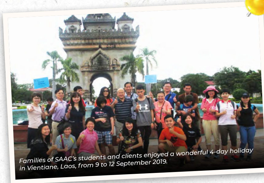
Families of SAAC's students and clients enjoyed a wonderful 4-day holiday in Vientiane, Laos, from 9 to 12 September 2019.

The trip in September this year saw a total of 22 participants from five families bonding over good food and beautiful natural sights in Vientiane, Laos, with a key highlight being a cross-cultural exchange with Vientiane Autism Center. Families and staff from Singapore spent a fun-filled day of meaningful engagement with many Laotian families.