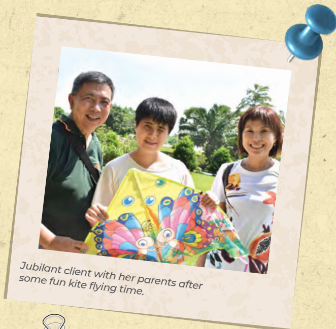
Jubilant client with her parents after some fun kite flying time.