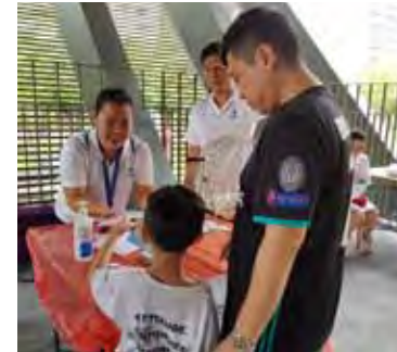
Hand hygiene games were conducted to raise residents' awareness of the importance of hand hygiene.