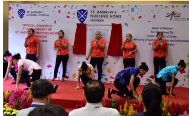
Conveying their call to care for the sick, SANH (Henderson) nursing staff sang and danced to the song, "Heal the World".

engage with the nursing home residents. This has worked well at SANH (Henderson) where neighbours of all ages have stepped forward to support and contribute to the residents' well-being.