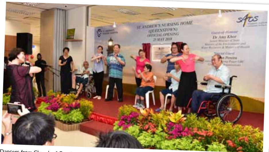
Dancers from Church of Our Saviour and Meiling Street Dance Friends performing with SANH (Queenstown)'s residents and SASC (Queenstown)'s client.

The nursing home has been blessed with many helping hands and immense support from the community groups in the neighbouring constituencies, churches and schools. Since the establishment of SANH (Queenstown) and its co-located senior care centre - SASC (Queenstown), neighbours have been actively volunteering their time to engage the seniors through organising activities and events. Contributing back to the community, SANH (Queenstown)