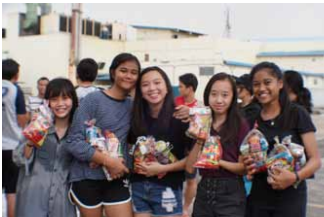
The youths gave out snacks that were meticulously chosen with love for the children living in the slums.