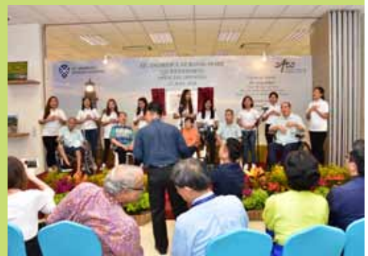
Heartwarming performances of nostalgic songs like "The Moon Represents My Heart" by the nursing team, residents of SANH (Queenstown) and a client of SASC (Queenstown).