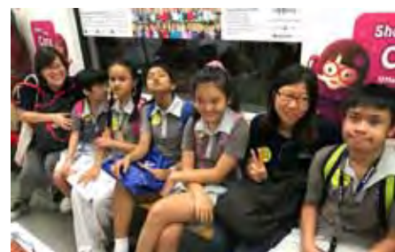
SAAC students riding the maiden voyage of the autism-themed train at its launch from Bukit Panjang to Bugis MRT station on 12 April 2018.

Nominated for four awards in the 37th Hong Kong Film Awards and bagging two, the movie realistically depicted a middle-aged mother's daily struggles of navigating through life and