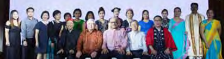
Long service award recipients of St. Andrew's Community Hospital (10 years and above) with members of SACS and SAMH Board and Management.