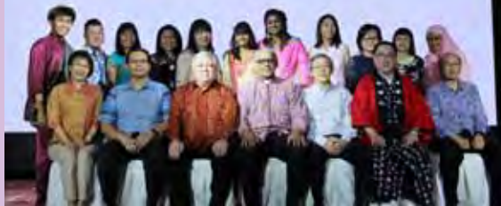
Long service award recipients of St. Andrew's Autism Centre with members of SACS and SAMH Board and Management.