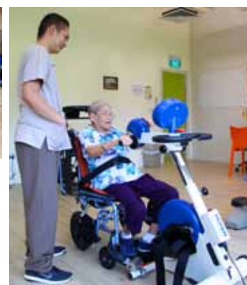
A client of Anglican Senior Centre (Hillview) undergoing rehabilitation.