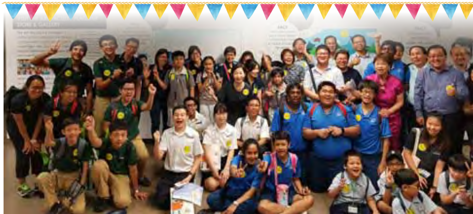
Students, clients and beneficiaries of ANS member partners coming together with big smiles to greet commuters at Bugis MRT station on 12 April 2018.

Every April signals the time to refocus on raising autism awareness in the community.