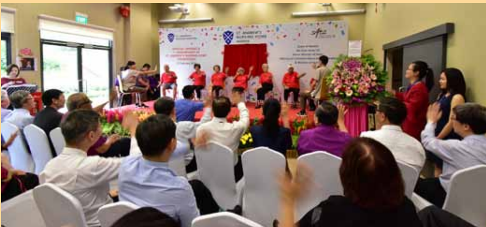
One of the highlights was the Activities of Daily Living (ADL) dance by residents of SANH (Henderson) and clients of SASC (Henderson). Guests were inspired to join in the fun of mimicking day-to-day activities such as grooming, cooking and cleaning.