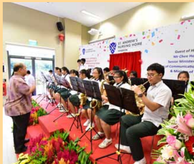
The official opening kicked off with a festive piece performed by the Christ Church Secondary School band.