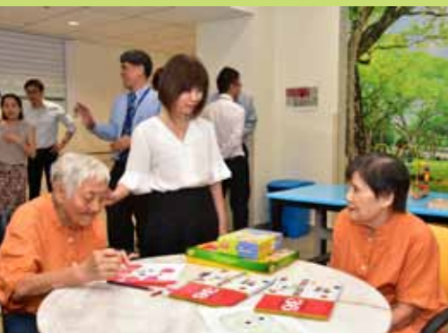
Dr. Amy Khor interacting with the residents during the SANH (Queenstown) tour.