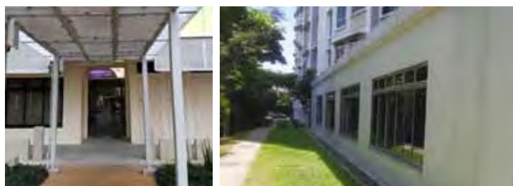
SACS widened its reach to care for Singapore's ageing population by operating 2 additional Senior Activity Centres (Studio Apartment) at Tampines and Woodlands in 2018.

ANG L I C A N S E R V I C E S E N G A G I N G T H E C O M M U N I T Y