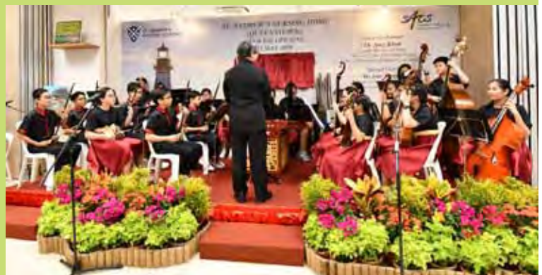
The official opening ceremony began with Queenstown Primary School's Chinese Orchestra performing three classic oriental pieces.