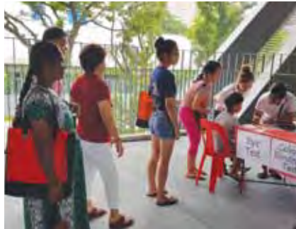
Residents queued up for basic eyesight tests.