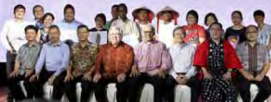
Long service award recipients of SACS with members of SACS and SAMH Board and Management.