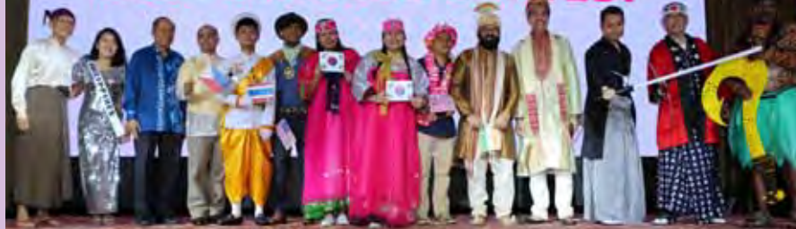
Our best dressed contestants in their beautiful national costumes.