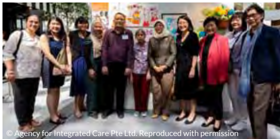
President Halimah Jacob, together with representatives from AIC, NAC as well as staff and residents of SANH (Buangkok).