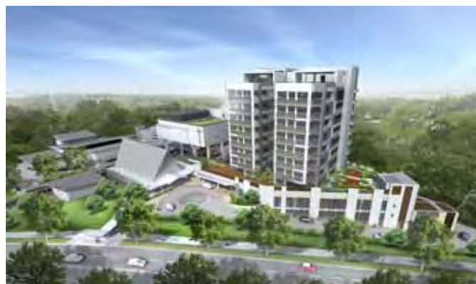
Artist's impression of St. John's - St. Margaret's Village.

When it is fully operational in 2021, SJSM Village will be an integrated provider of childcare and infant care as well as medical, nursing, respite and home-based care for seniors. The complex will feature spaces and programmes that facilitate and nurture intergenerational connectivity and activities, with the aim of improving the quality of life for both seniors and pre-schoolers.