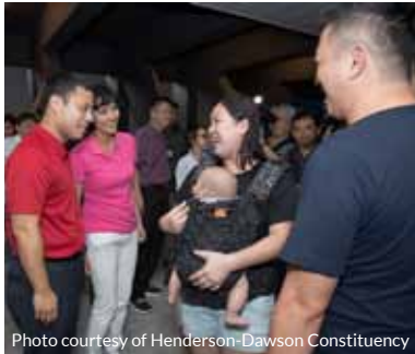
Mr. Desmond Lee and Ms. Joan Pereira interacting with the residents during the Ministerial Community Visit.

Organised by Henderson-Dawson Citizens' Consultative Committee (CCC), a Ministerial Community Visit was held on 25 March 2018. Mr. Desmond Lee, Minister for Social and Family Development and Ms. Joan Pereira, Member of Parliament for Tanjong Pagar Group Representative Constituency, Henderson-Dawson Constituency, were present to engage residents and learn more about the various programmes and initiatives implemented in the constituency.