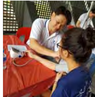
SANH (Queenstown) staff conducted blood pressure screening for residents.