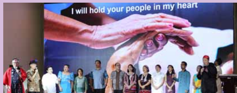
Management and staff from the various services of SACS and SAMH singing "Here I Am, Lord" together.