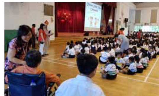
Students from New Town Primary School lifted the spirits of the residents through their bonding, singing and dancing sessions with them.