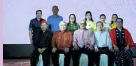
Long service award recipients of St. Andrew's Community Hospital with members of SACS and SAMH Board and Management.