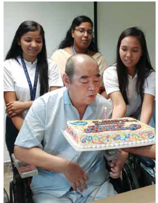
Staff and residents who were born in the month of April celebrating SANH (Queenstown)'s first anniversary and their special day.