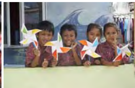
Happy children with the paper windmill they created with the help of the youths.