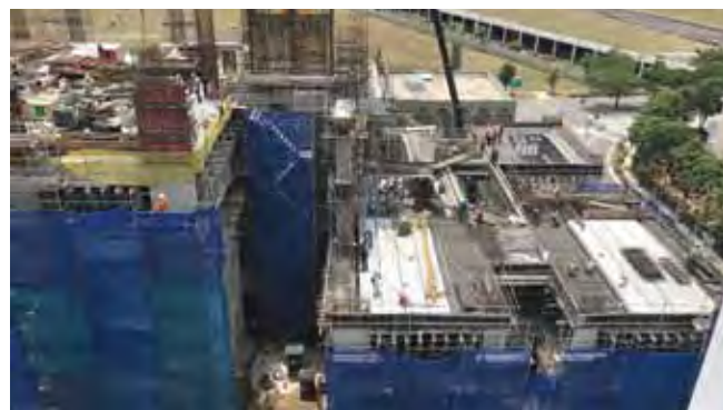
Construction of SAAH (Sengkang) is on schedule and the home is expected to be operational by April 2019.

The Adult Disability Home (ADH) that St. Andrew's Autism Centre (SAAC) is co-developing with the Ministry of Social and Family Development (MSF) began construction on 21 February 2017. The ADH will be known as St. Andrew's Adult Home (SAAH) (Sengkang). A Day Activity Centre (DAC) for up to 50 clients will be co-located with the home, which will have the capacity to house 200 residents. As of 19 April 2018, the 10th floor for one wing and the 7th floor for the other wing have been completed. Work on fittings and equipment, programme, staffing and logistics to support the residential home was on schedule. The new home is slated to receive residents in April 2019.