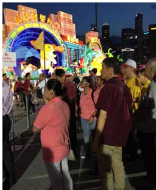
Residents and staff of St. Andrew's Nursing Home (Buangkok) immersed in the festive celebration.

As part of St. Andrew's Nursing Home (Buangkok)'s effort to encourage social interactions among residents and to enable our residents to enjoy festive celebrations, our staff brought 10 residents to River Hongbao at Marina Bay Platform Float on 22 February 2018. Despite their initial apprehension, our residents conquered their fear of crowds quickly and enjoyed the outing. Everyone was immersed in the celebratory mood and splendid decorations, with a display of 500 lanterns and beautiful fireworks. The night also brought back happy childhood memories for our residents as they visited stalls selling nostalgic food and an indoor exhibition which displayed life-sized models of a kampong house, an old Housing Board flat and a modern home dining area.