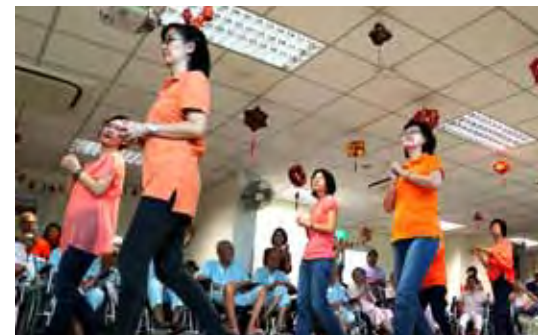
Volunteers from Evergreen Ministry of the Church of Our Saviour performing a song and dance item for the residents.

SANH (Queenstown) welcomes individuals and groups who can bring joy and hope to our beneficiaries and gain personal satisfaction through volunteering. You can make a difference in the lives of the residents with your gifts and talents. For more information on volunteer opportunities in SANH (Queenstown), please contact SANH (Queenstown) at 6877 4677 or email qnhenquiries@sanh.org.sg .