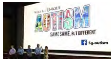
Representatives of ANS member partners welcoming invited guests and public to the special movie preview of "Tomorrow is Another Day" on 9 April 2018.

All in all, WAA(S) 2018 sparked a new beginning in its public outreach through social media and the arts, including a short clip "Buddy" and the critically acclaimed production of "The Curious Incident of the Dog in the Nighttime" jointly presented by the Singapore Repertory Theatre and Esplande -Theatres on the Bay.