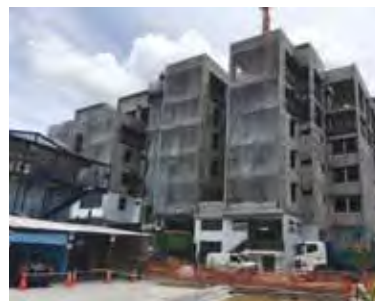
Construction of St. Andrew's Nursing Home (Taman Jurong).

SACS will also start operating a 290-bed nursing home at Taman Jurong from February 2019.