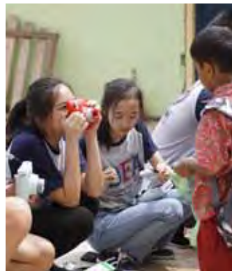
The youths capturing precious memories with children living in the slums.